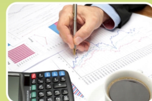
DPR and FUPs