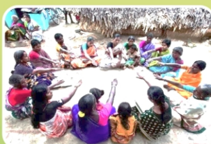
Support to FPOs/ SHGs/ Cooperatives