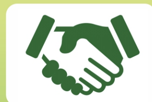
Branding & Marketing