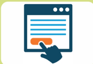
Application for the Subsidy